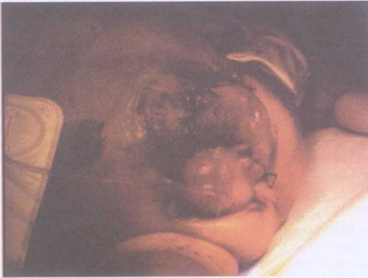
FIG. 3. Case No. 4. Male patient. The bladder wall utilized as a sheet to cover the large abdominal wall defect.

At the present stage, patients had no stomas and were wearing no appliances. There were no abdominal wall defects with cosmetically acceptable abdominal wound scars with nearly normal looking external genitalia apart from the small phallus in the male and the slightly eccentric anal orifice in two of the cases towards the right side.